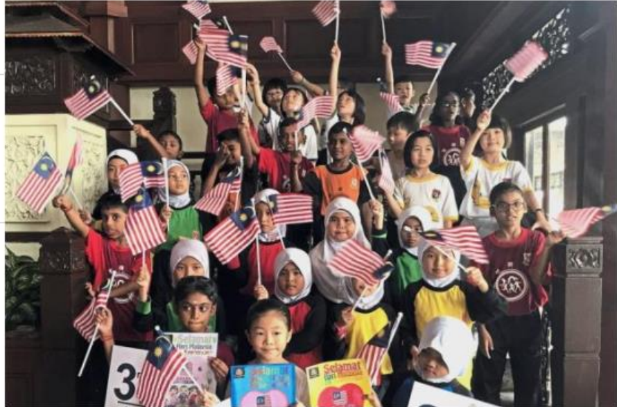
The pupils posing for a group photo at Pulai Springs Resort in Johor Baru.

JOHOR BARU: Pulai Springs Resort organised a fun-filled programme for 30 Year One pupils with the aim to promote the spirit of patriotism.